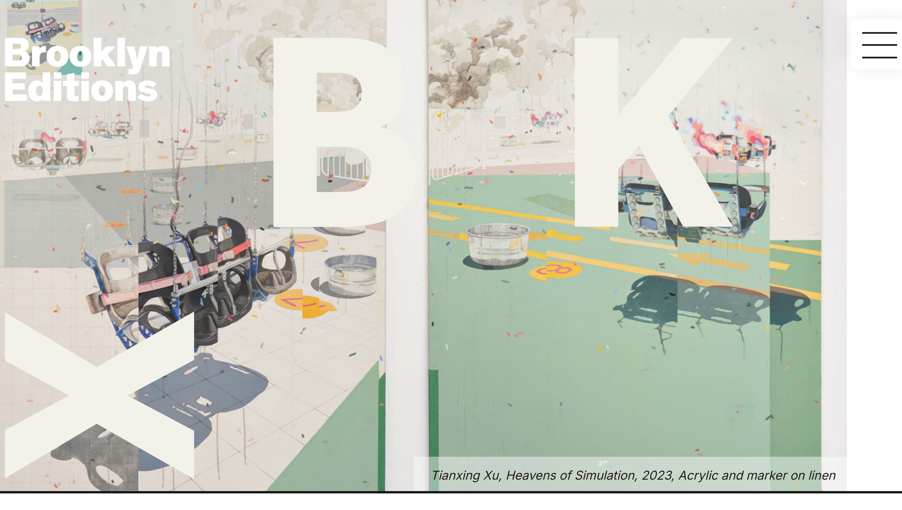
Tianxing Xu, Heavens of Simulation, 2023, Acrylic and marker on linen