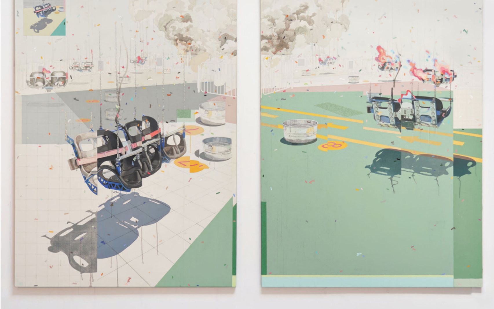
Tianxing Xu, Heavens of Simulation, 2023, Acrylic and marker on linen

For Tianxing, the work remains incomplete without the presence of the audience. Viewer participation plays a large role in the artist's practice, as he often crafts moments for the viewer to 'fill in the blanks', both metaphorically and literally, in his narratives. We greatly anticipate our upcoming collaboration with him to see how we can push these ideas further and create a project together that will truly be special.