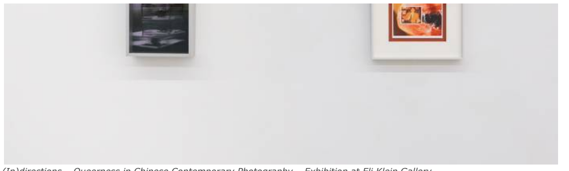
(In)directions – Queerness in Chinese Contemporary Photography – Exhibition at Eli Klein Gallery

(In)directions: Exploring Queerness in Chinese Contemporary Photography at Eli Klein Gallery