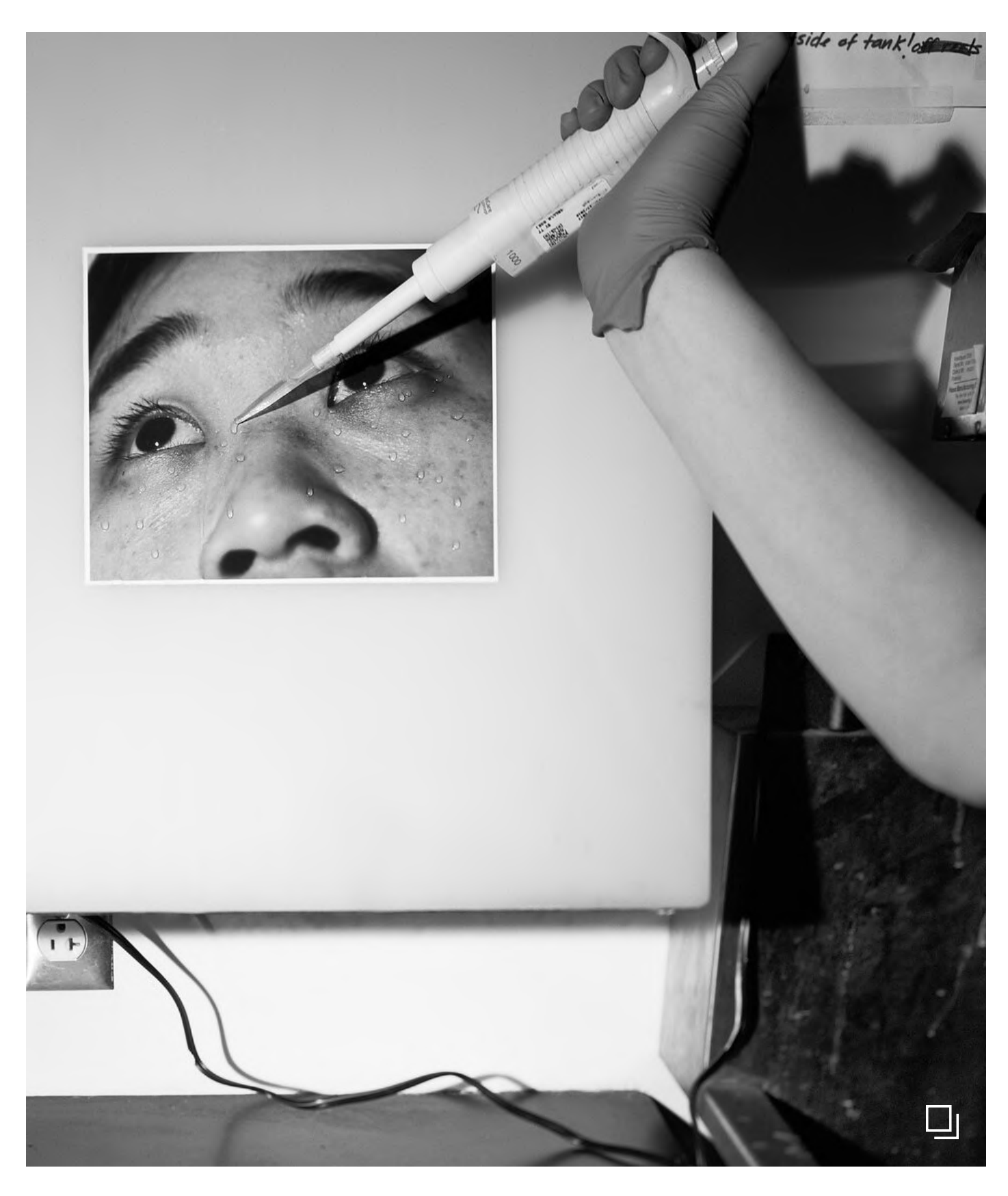
Kanthy Peng, Artificial\ Tear (2019). Courtesy of the artist and Eli Klein Gallery © Kanthy Peng