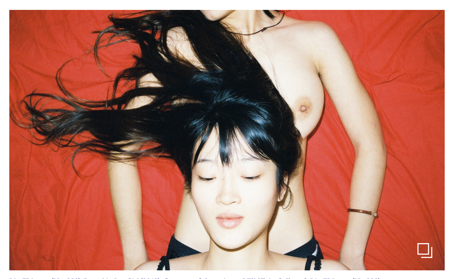
Lin Zhipeng (No. 223) Pumpkin Is a Girl (2013). Courtesy of the artist and Eli Klein Gallery © Lin Zhipeng (No. 223)

"I want to catch these moments as a documentarian, and by doing that, find life in full," 223 explained. Yet, his relentless dedication to record-keeping the impressions and sensory data of the "real" world produces images that feel intensely cinematic, revealing that the everyday is itself the most exhaustive and convincing fiction.