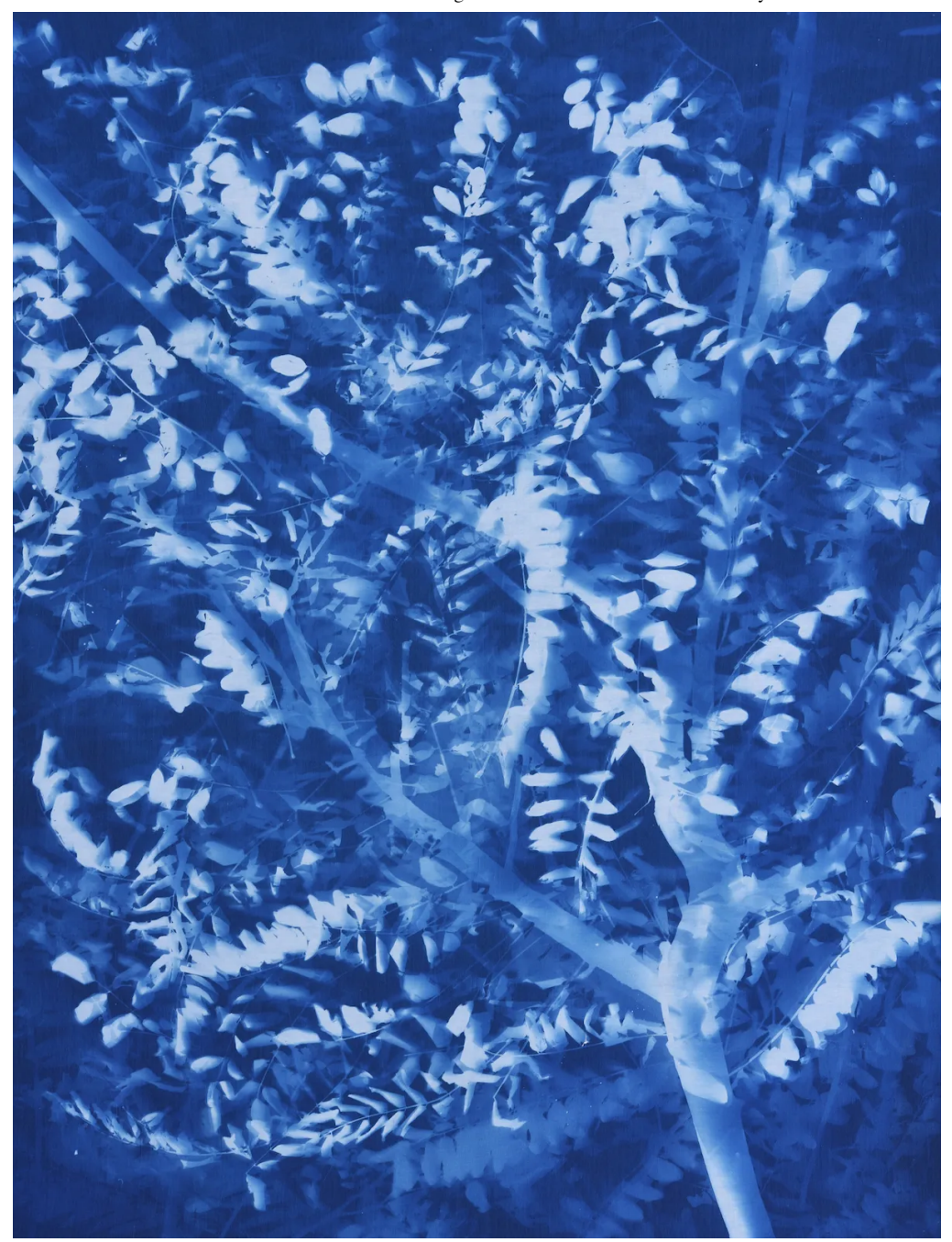
Zhang Dali, Herbarium Pagoda Tree (S. japonicum) (2), 2020. Blue cyanotype on cotton, 53 1/8 x 37 3/4 inches (135 x 96 cm)