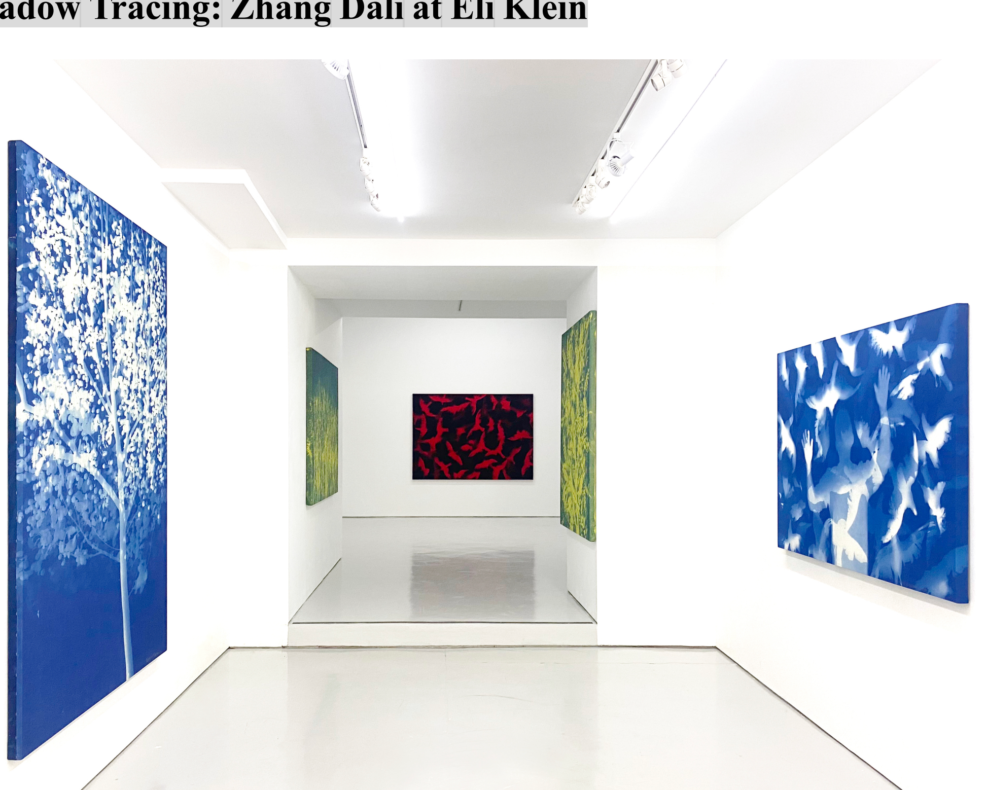
Installation view, Zhang Dali: Suffocation at Eli Klein Gallery.