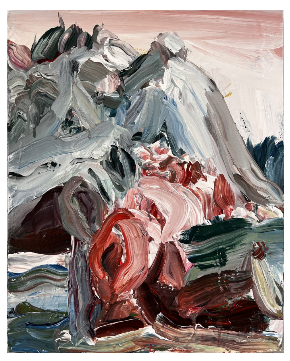
Xiao Kegang, Wood in Forest X (2022).

Chinese artist Xiao Kegang (b. 1968) has developed a practice that explores the boundaries of painting, such as the line between abstraction and figuration, and the effects of light and color. Perspective and its variability are also a key theme in the artist's work; Kegang's painterly and gestural compositions could be understood variably—where one might see a mountainous landscape, another might find a still life. Kegang's current solo exhibition, "Detour (https://www.artnet.com/galleries/eli-klein-gallery/detour)"—the artist's solo debut in the United States—is on view at Eli Klein Gallery through March 25, 2023. Comprising 19 canvases, "Detour" traces Kegang's recent experimentations with painting. Continuing his play with perspective—both formal and illusory—in this series foregrounds and backgrounds become essentially interchangeable.