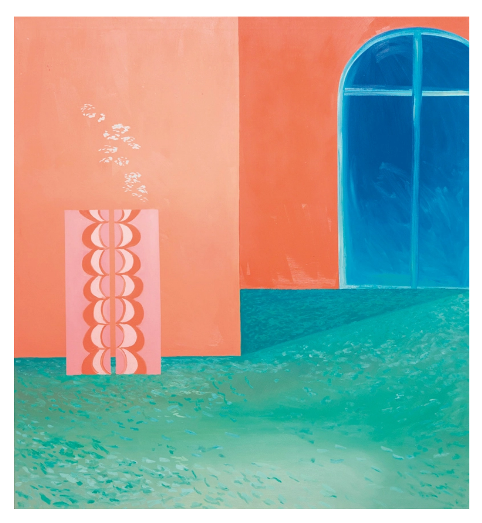
Lucía Tello, Habitación (2021).

Centering on contemporary female stereotypes, the paintings of Lucía Tello (b. 1996) reflect on both personal and societal gender identities and the myriad ways that media capitalizes on these clichés. Originally from Seville, Tello distills the themes, motifs, and symbols that have come to be associated with the feminine and recasts them in her paintings as focus points for reflection on and interrogation of mass media's portrayal of women. By surveying and engaging with a multitude of different sources, Tello seeks a common identity—or, perhaps, irreducible form—which in the context of media representations of women often results in a preposterous fusion of fiction and reality.