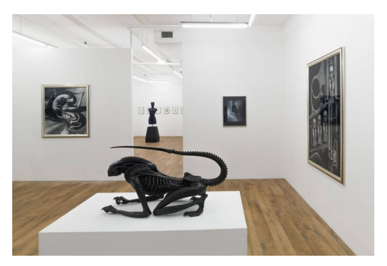
Installation view, "H.R. Giger: HRGNYC," at Lomex, New York.