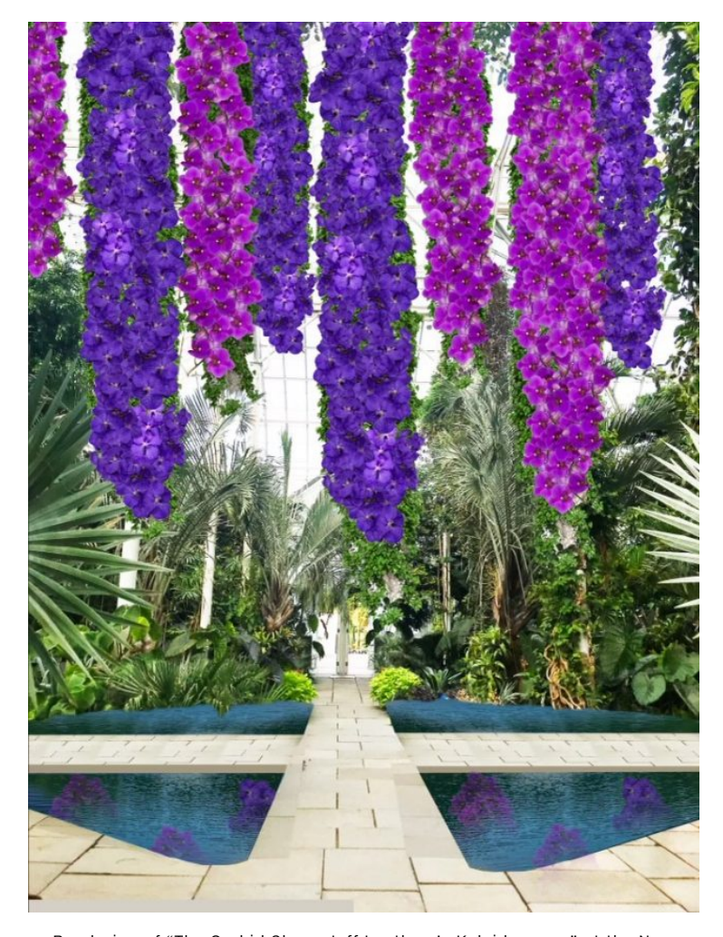
Rendering of "The Orchid Show: Jeff Leatham's Kaleidoscope" at the New York Botanical Garden.