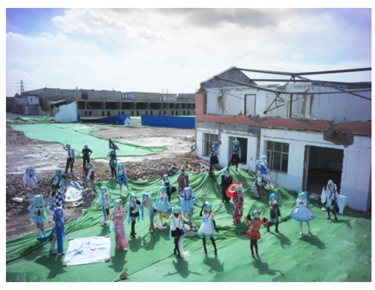
Ye Funa, Subspecies - 30 Hatsune Miku (2019).

3. "Renew: A Recent Survey in Chinese Photography (https://www.artnet.com/galleries/eli-klein-gallery/renew-a-recent-survey-in-chinese-contemporary-photography-1/)" at Eli Klein Gallery (https://www.artnet.com/galleries/eli-klein-gallery/), New York