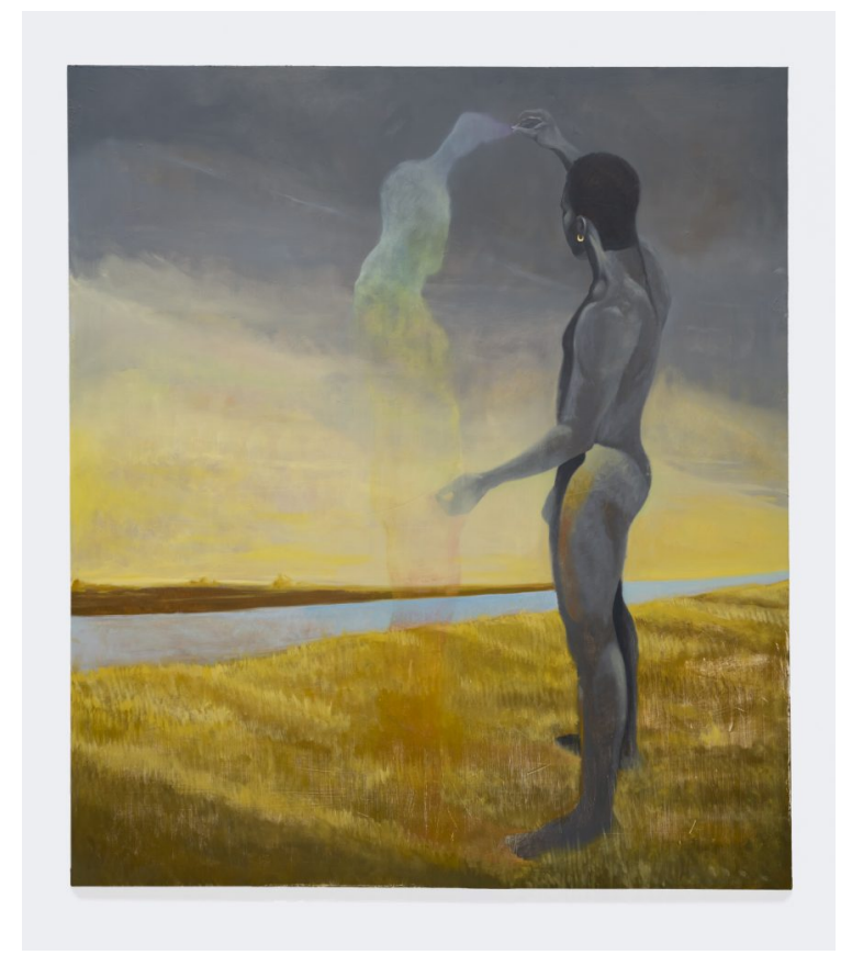
Dominic Chambers, Self-Summoning (shadow work) (2022).