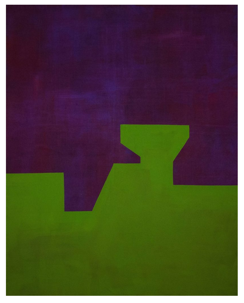
Liv Mette Larsen, Vertical Nightview III (2018).