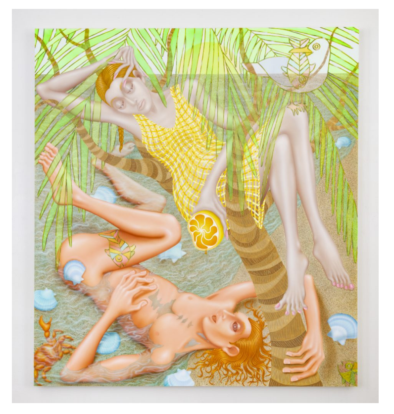
Wendell Gladstone, Sun Dress (2021).