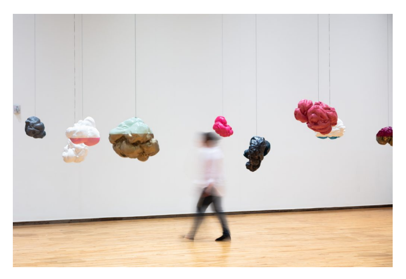
Kim Faler, Double Bubble (2020).