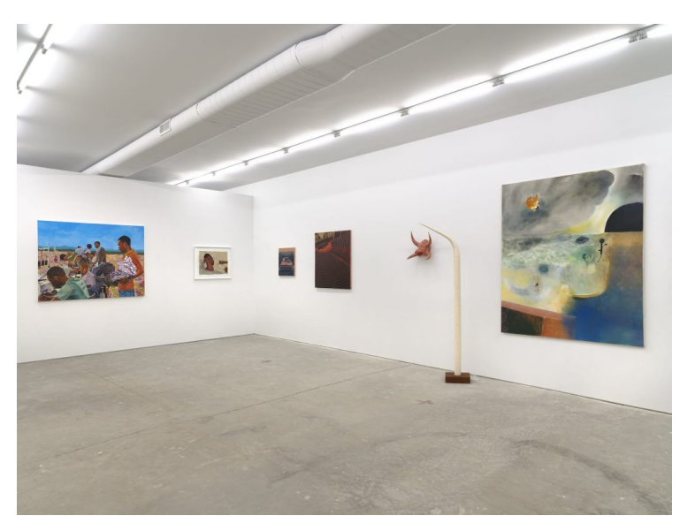
Installation view, "Pa'l Patio", 2022.