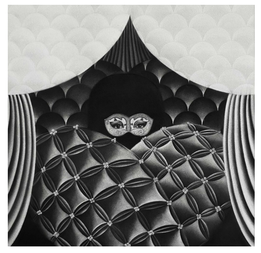
Velvet Other World, Worship of the Lady from Afar, 2021.