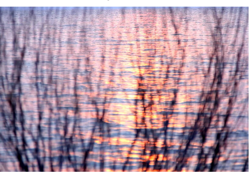
Friday, October 1