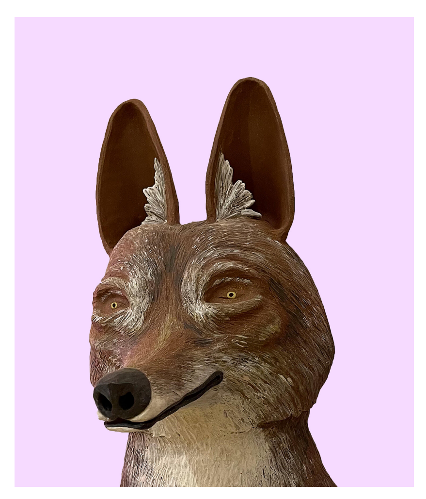
Yvette Molina, Coywolf Guardian (detail).